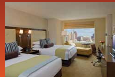
Two Double Beds